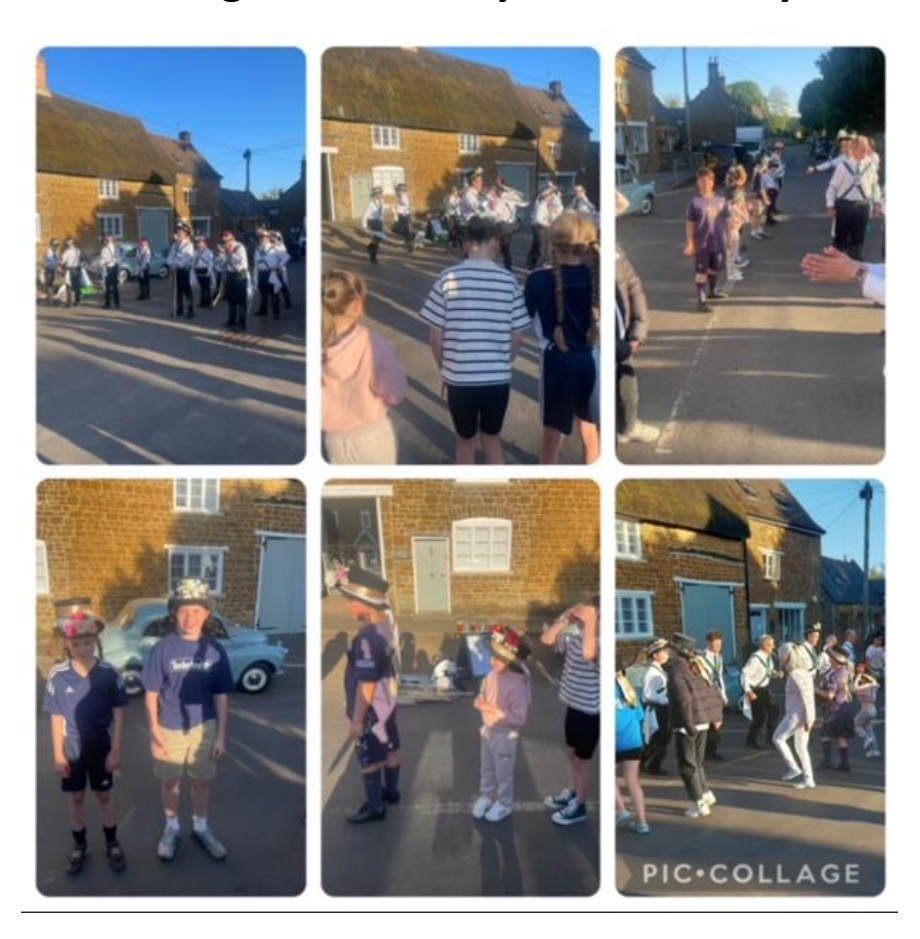
Class 4 theatre trip, Northampton – 'Pig Heart Boy'