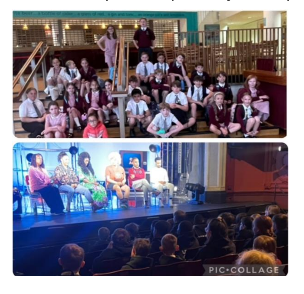
Contemplative, Compassionate and Courageous