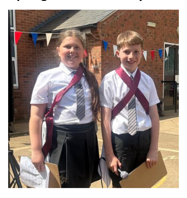
Our Comperes for the afternoon