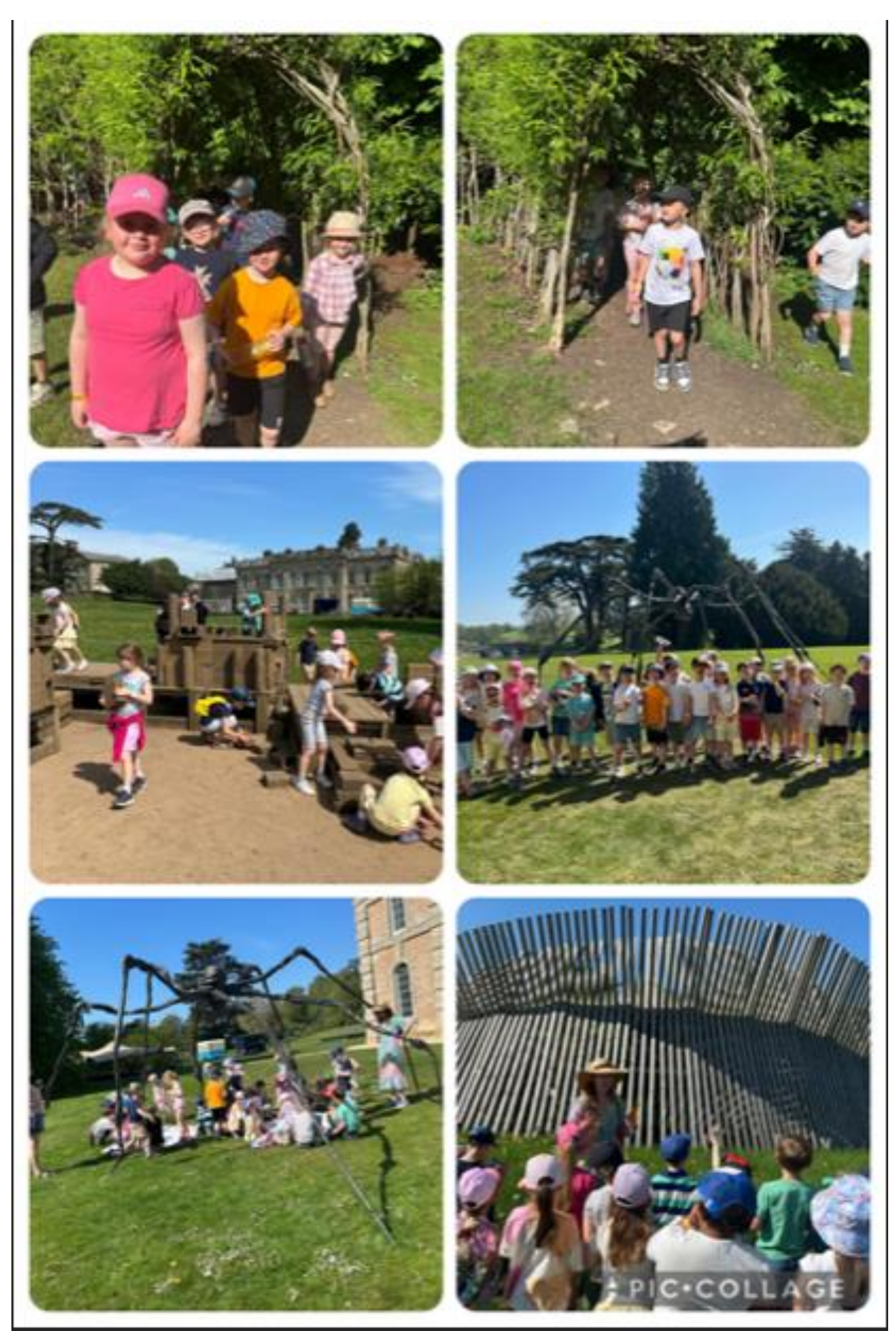
<u>Class 1 & 2 trip to Compton Verney – 1<sup>st</sup> May 2025</u>